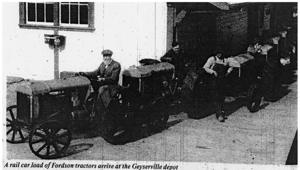
A rail car load of Fordson tractors arrive at the Geyserville depot

He continued to sell Studebakers and, in 1929, obtained a franchise for Chevrolets as well. He was doing a substantial business in Fordson tractors, not surprising in a town surrounded by some of the finest prune orchards, vineyards and hopyards in the