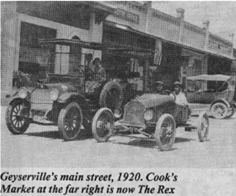
Geyserville's main street, 1920. Cook's Market at the far right is now The Rex